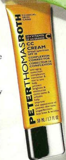
Multitasking skincare must-haves: exfoliating cleansing wipes and does-it-all CC Cream.