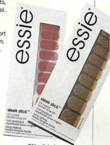
DIY nail designs done right.

QUICK-DRY: Julep's Freedom Polymer Top Coat, $18, prevents chipping longer than traditional formulas, thanks to an innovative natural-light-activated polymer. It's not quite as enduring as a gel manicure, but you can take it off with regular remover instead of needing to soak your fingers in harsh acetone for 30 minutes.